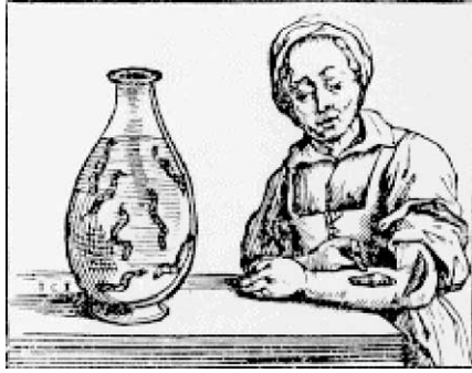
Figure 2 Bossche, Willem van den. Historia Medica (Bruxellae, 1639).

far less painful than the wound inflicted by the other two methods. The fleam consisted of a blade cocked by a spring mechanism, and was also known as a spring lancet. The scarifier was used to make several cuts in the skin at one time, and a bleeding cup was placed over the abrasions. In general, leeches were considered to be of greater benefit when blood had to be removed from a part of the body where a lancet or cup could not be used, such as ' haemorrhoidal tumours, prolapsed rectum and inflamed vulva ... watching that they did not creep out of reach within any of the internal cavities, as serious results might ensue '. 27