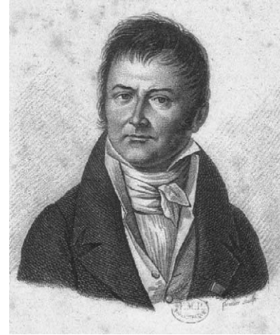
Figure 4 François-Joseph-Victor Broussais (1772–1838).

Broussais has been referred to as 'the most sanguinary physician in history' 20 (Fig. 4). He proposed that all diseases resulted from an excess build up of blood and alleviation of this condition required heavy leeching and starvation. French physicians would commonly prescribe leeches to be applied to newly hospitalised patients even before seeing them. 21 Leeches became the therapeutic agent par excellence , and even inspired fashion. Females wore imitation leech decorations; ' fastidious ladies ... used to deck their dresses with embroidered leeches ' 22 and their cosmetic uses included enhancement of their pale complexions.